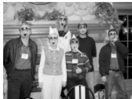
Realizing the masks we each wear is part of the SALTS experience!

“This ministry is a wonderful tool in finding freedom after years of bondage in lies!”