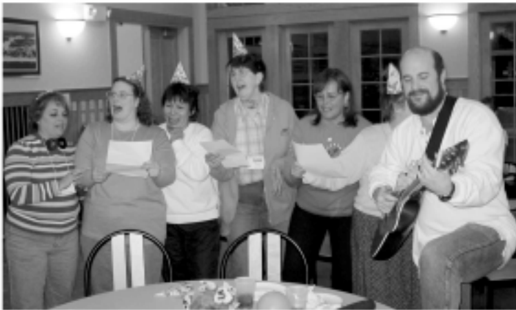
People find their voices at SALTS.

I learned that God hungers for our hearts even more than we hunger to give them. He will purify me through my pain, His name will be written on my hands the same way it was written on His, through the passion of suffering. That is what I long for, to know all of His passion. Sitting in the brokenness of life keeps my passion clean. SALTS (is where) I have most experienced God. And I will never be the same again.